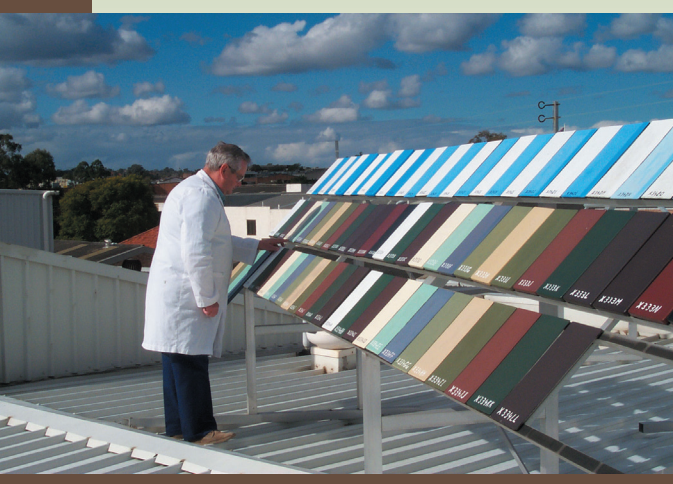
One of two exposure racks located at Duralex Paints