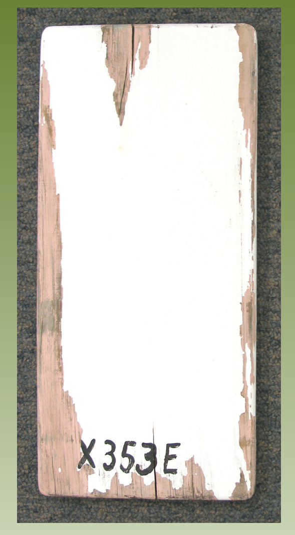
*3 coat alkyd system after 5 years roof exposure (note timber decay).

The alkyd based products were all from a major well known manufacturer.