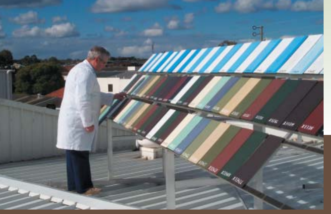
One of two exposure racks located at Duralex Paints